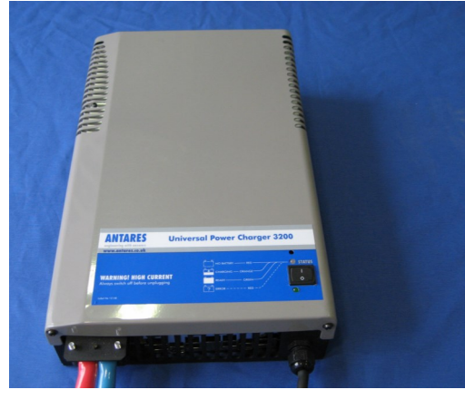
Approved condition for use (CE mark): Marine and Automotive applications Fixed installations in buildings Type approved: E13 3026 and E13 3027

The Universal Power Charger 3200 series is the largest of the UPC range and has a special niche.